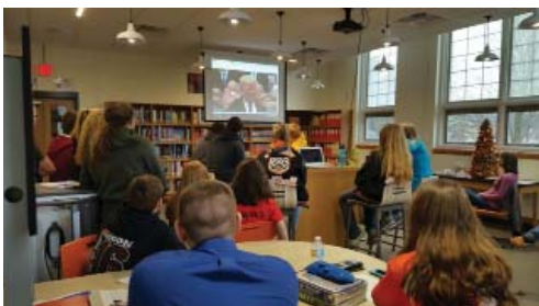
Lucas High School witnessing history in the new iLAB on Inauguration Day 2017!

After the competition we will return to the Lucas Community Center for a pizza party. This is all made possible by the Lucas Sustaining Fund.